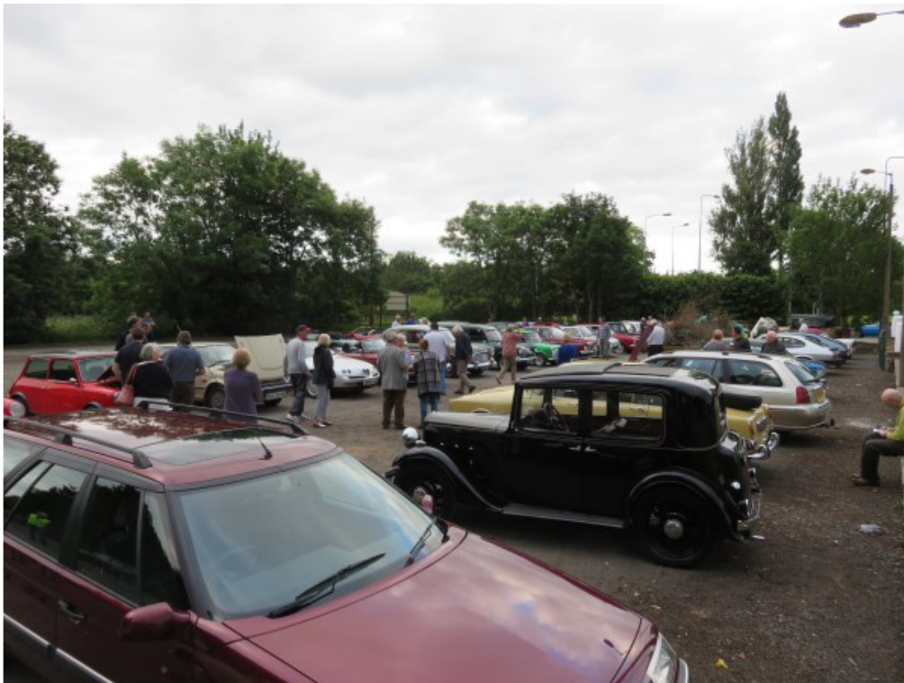
Concours Night at the Bridge

Meetings are held at the Bridge Inn, Walshford, North Yorkshire LS22 5HS Phone:01937 580115 On 2nd Tuesday each month 8.00pm, presentations at 8.30 Special price Carvery available from 7.00 pm for members and visitors