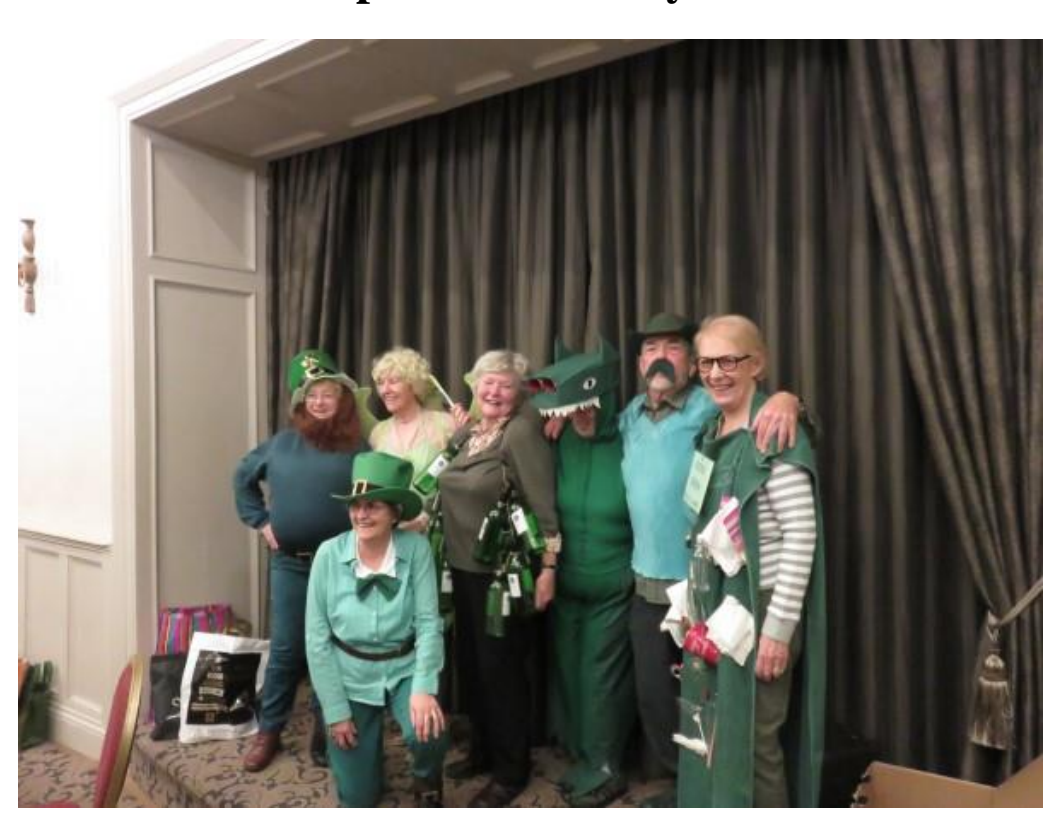
The Green parade

Meetings are held at the Bridge Inn, Walshford, North Yorkshire LS22 5HS Phone:01937 580115 On 2nd Tuesday each month 8.00pm, presentations at 8.30 Special price Carvery available from 7.00 pm for members and visitors