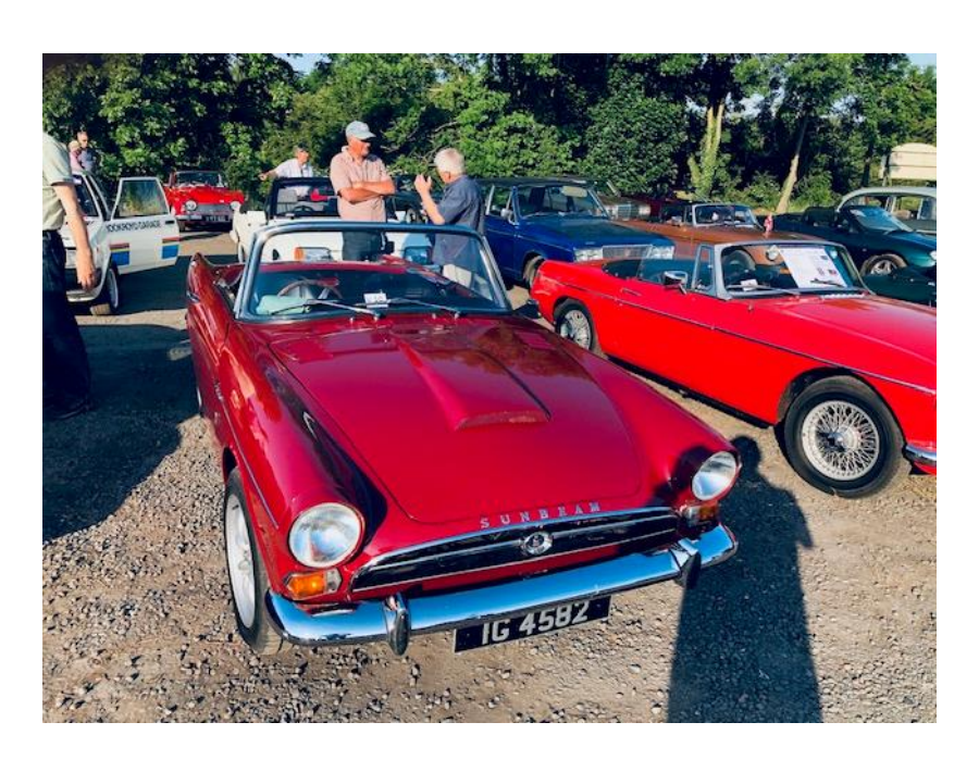
The Visitors winning car at our Concours night

Regular monthly meetings are held at the Bridge Hotel, Walshford, Wetherby, LS22 5HS on second Tuesday each month at 8.00 pm.