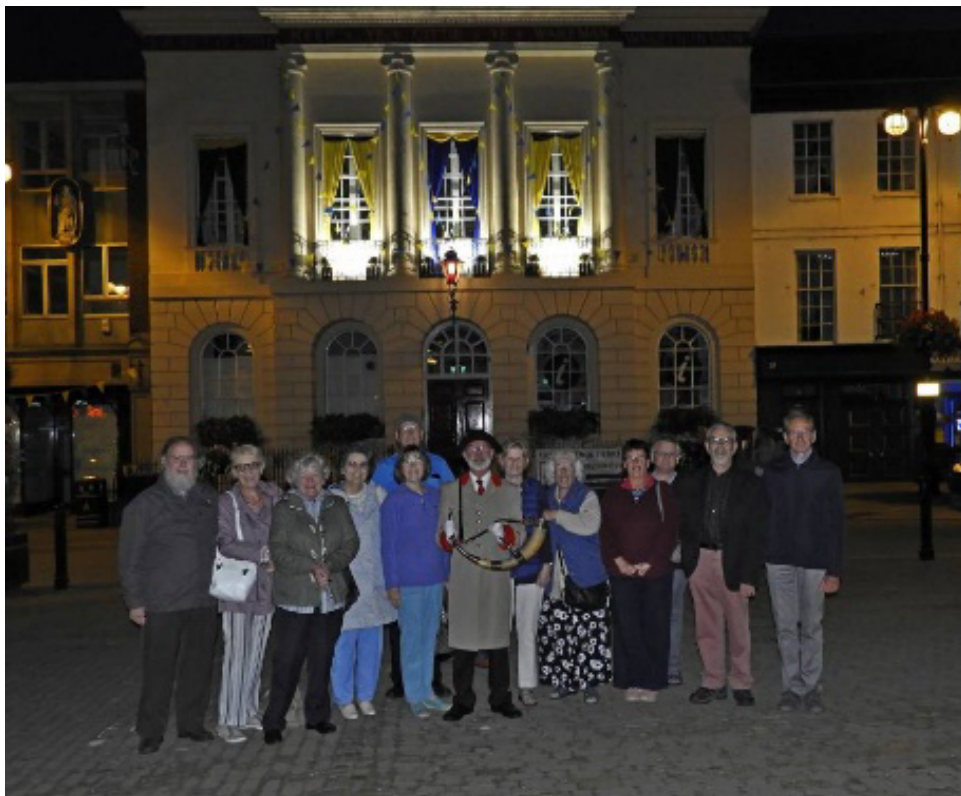
WCCC members with the Knaresborough Hornblower

Meetings are held at the Bridge Inn, Walshford, North Yorkshire LS22 5HS Phone:01937 580115 On 2nd Tuesday each month 8.00pm, presentations at 8.30 Special price Carvery available from 7.00 pm for members and visitors