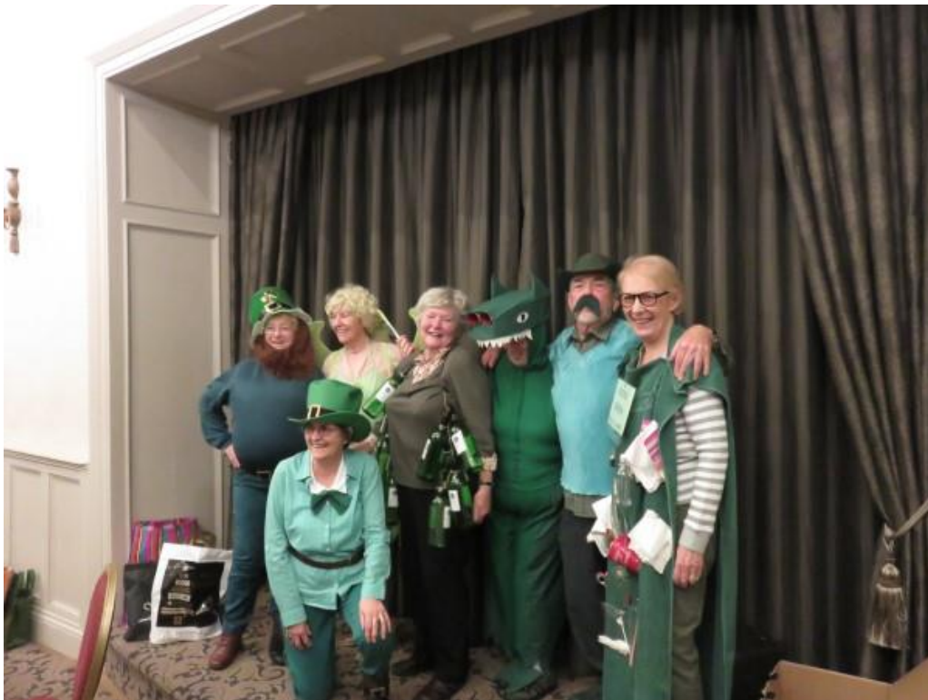
The Green parade

Meetings are held at the Bridge Inn, Walshford, North Yorkshire LS22 5HS Phone:01937 580115 On 2nd Tuesday each month 8.00pm, presentations at 8.30 Special price Carvery available from 7.00 pm for members and visitors