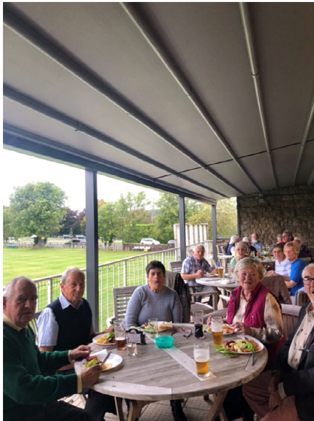
The Club Barbecue

Meetings are held at the Bridge Inn, Walshford, North Yorkshire LS22 5HS Phone:01937 580115 On 2nd Tuesday each month 8.00pm, presentations at 8.30 Special price Carvery available from 7.00 pm for members and visitors